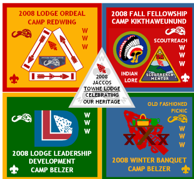
Fall Events patch set (not to scale)

Winter Banquet Theme: Old Fashioned Picnic Camp Belzer