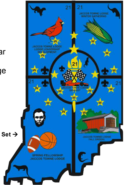
2017 Event Patch Set →