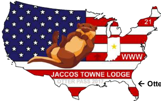
← Otter Pass Patch