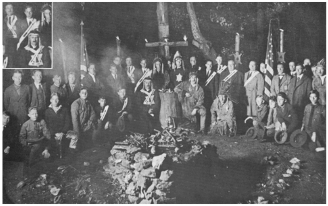
First organizational meeting of the Grand Lodge, Camp Biddle, 1921 notice sashes worn over the left shoulder (Brotherhood), and the three sashes worn at once (Vigil)

In this era, Arrowmen who were Ordeal members wore a white sash with a red arrow over their right shoulder. Brotherhood members wore a white sash with a red arrow over their left shoulder. A brother in the Vigil Honor wore three sashes-- one over the right shoulder, one over the left shoulder and one around the girth of his waist. There were no sashes for the Vigil Honor produced until 1933.