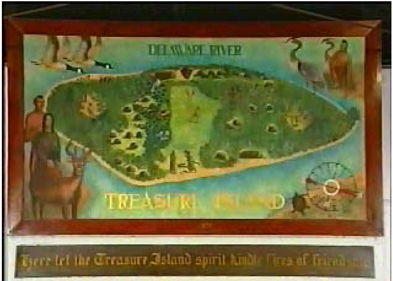
Here let the Treasure Island spirit kindle fires of freedom.