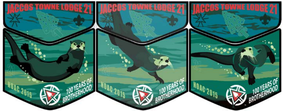
Trader Patch Sets