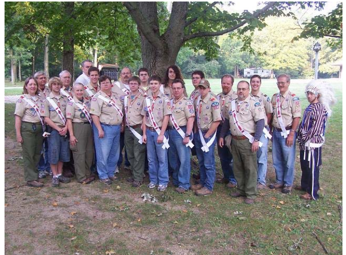
New Vigils from Lodge Ordeal

Jaccos Towne Lodge congratulates its new Vigils!