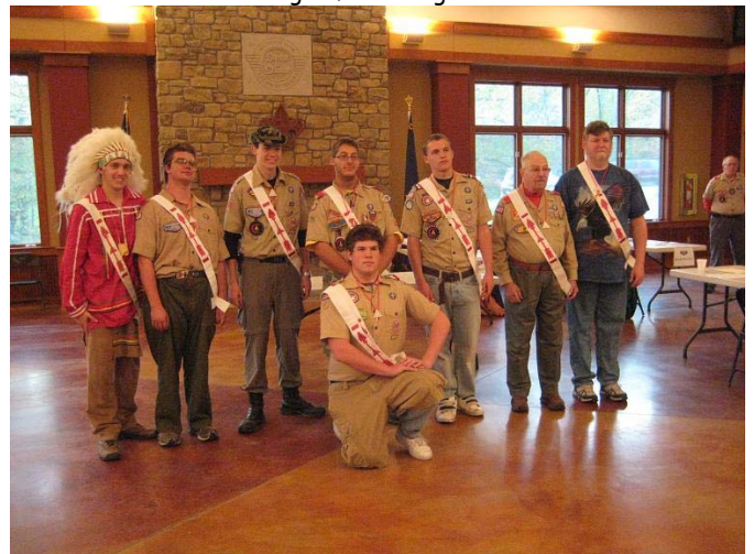
New Vigils from Fall Fellowship with Vigil Chief