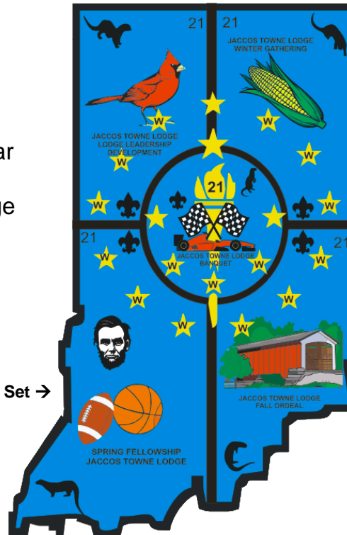
2017 Event Patch Set →

Otter Pass will go on sale at Lodge Ordeal Cost is $100.