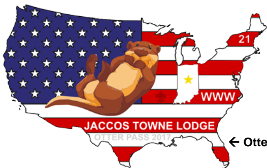
← Otter Pass Patch